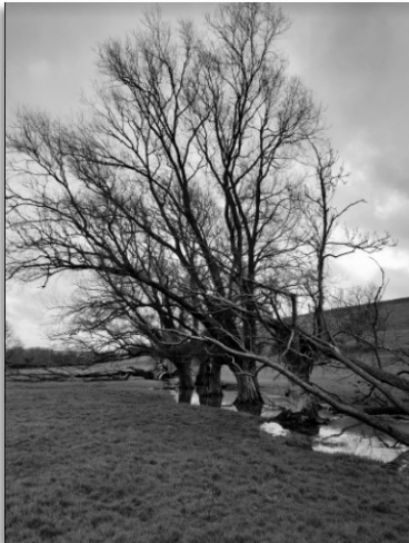
Early spring, Compton Farm (Anne Heath)