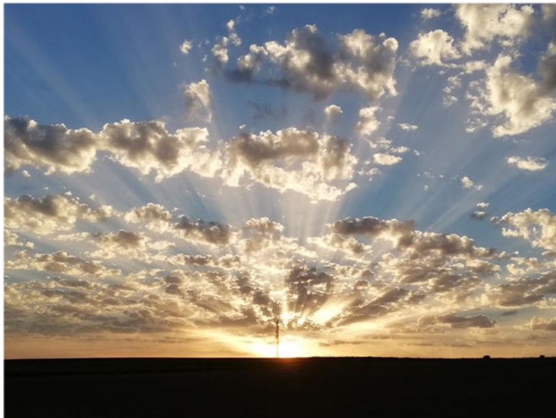
Sunset behind Enford mast.

If you are interested in photography please contact us via email enfordcameraclub@gmail.com