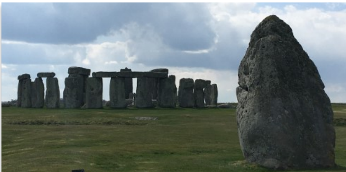
Stonehenge, the afternoon before visitors were allowed back (Anon Enford resident)